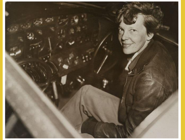
Amelia Earhart sitting in the cockpit of the Lockheed Electra plane she flew in her last adventure.

A lighthouse was built on Howland Island in her memory.