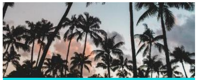
What can you see around you?