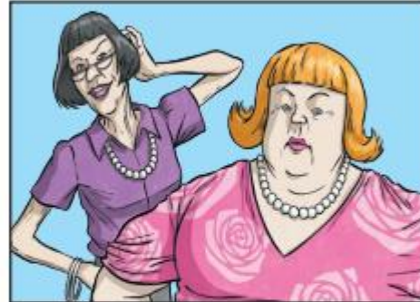
Popped off by a peach - sisters Sponge and Spiker.

Picking up speed, the fiendish peach hurtled down the