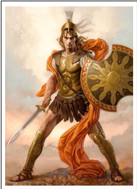
Jamulho / Legend of the Cypriots