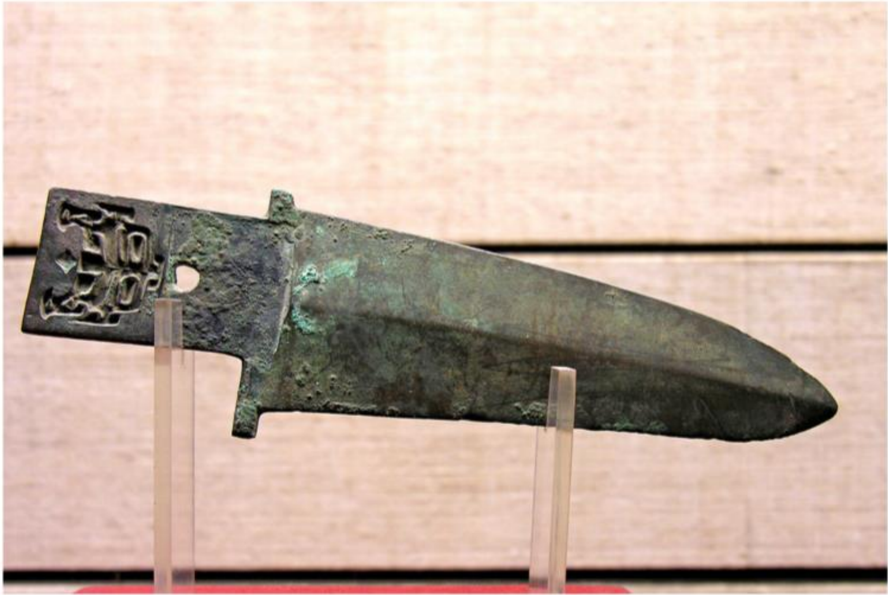
Shang Dagger Blade Made from bronze