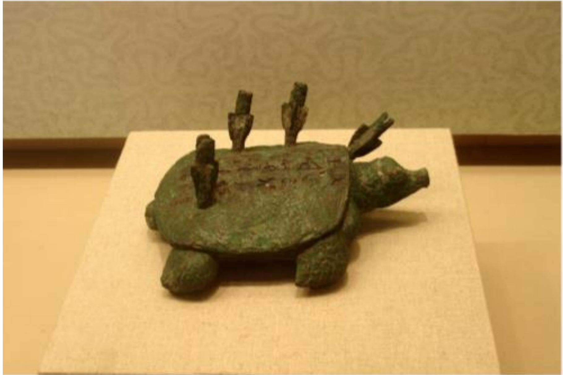
Turtle with Arrows Made from bronze