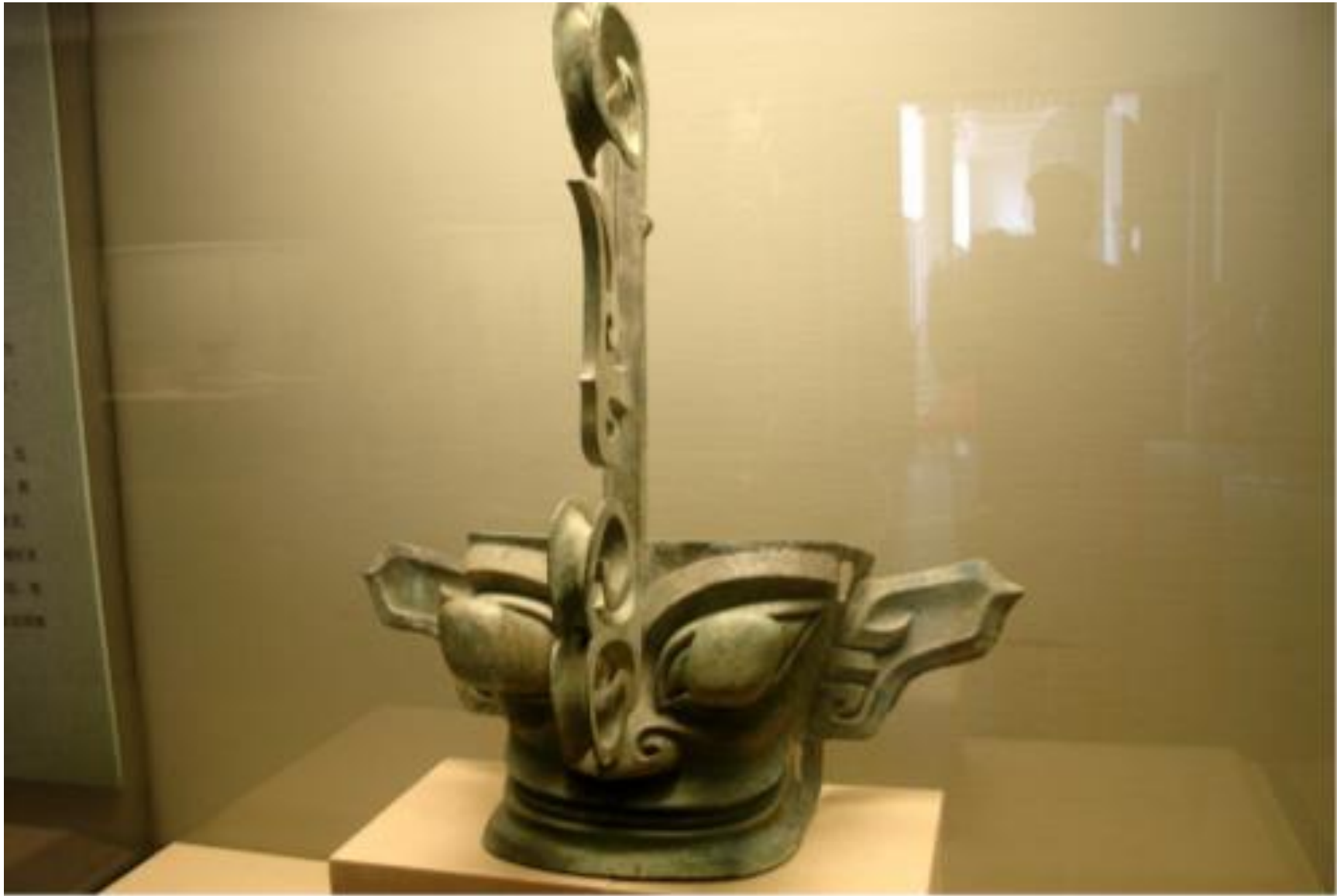
King Cancong Mask Made from bronze