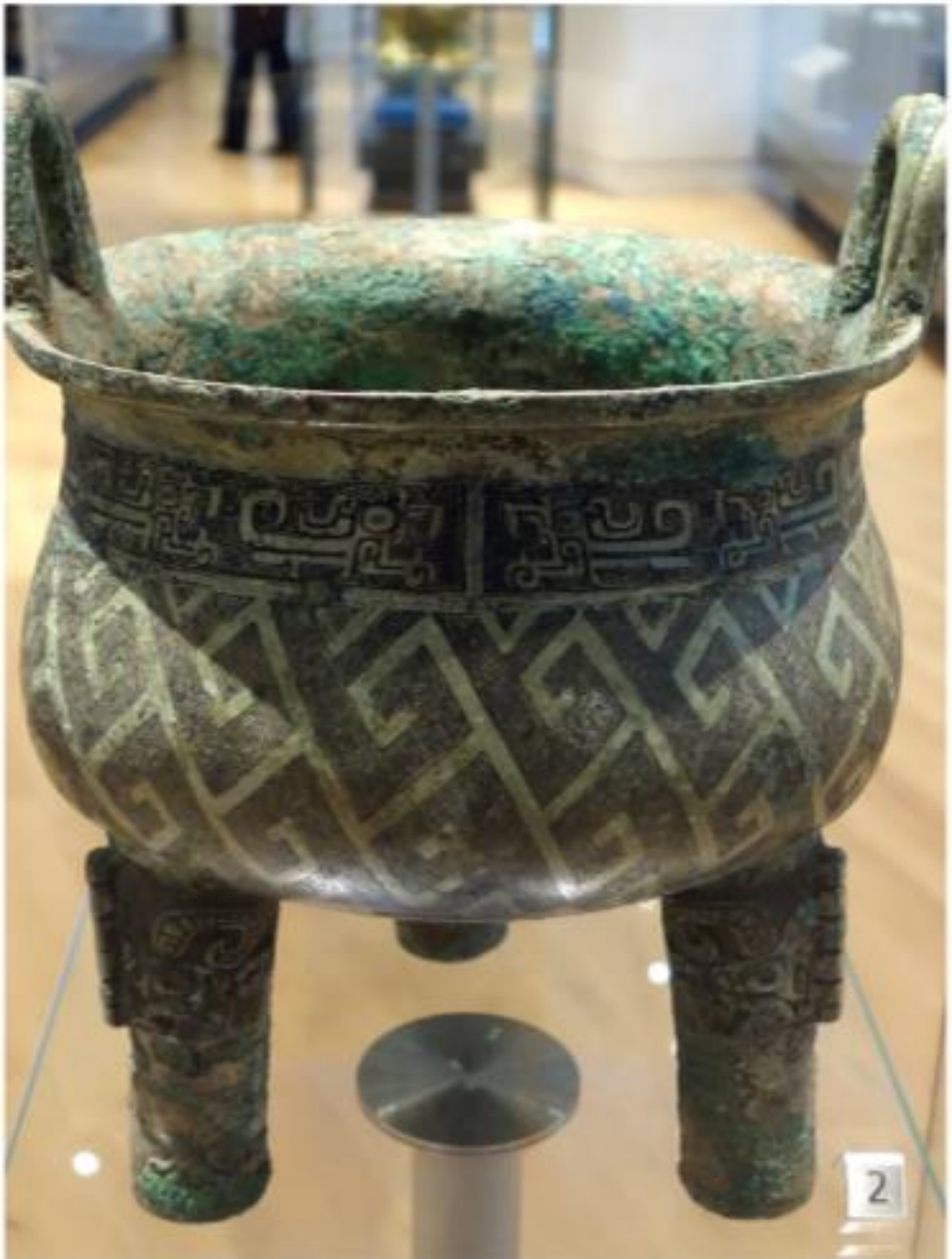
Ding Made from bronze