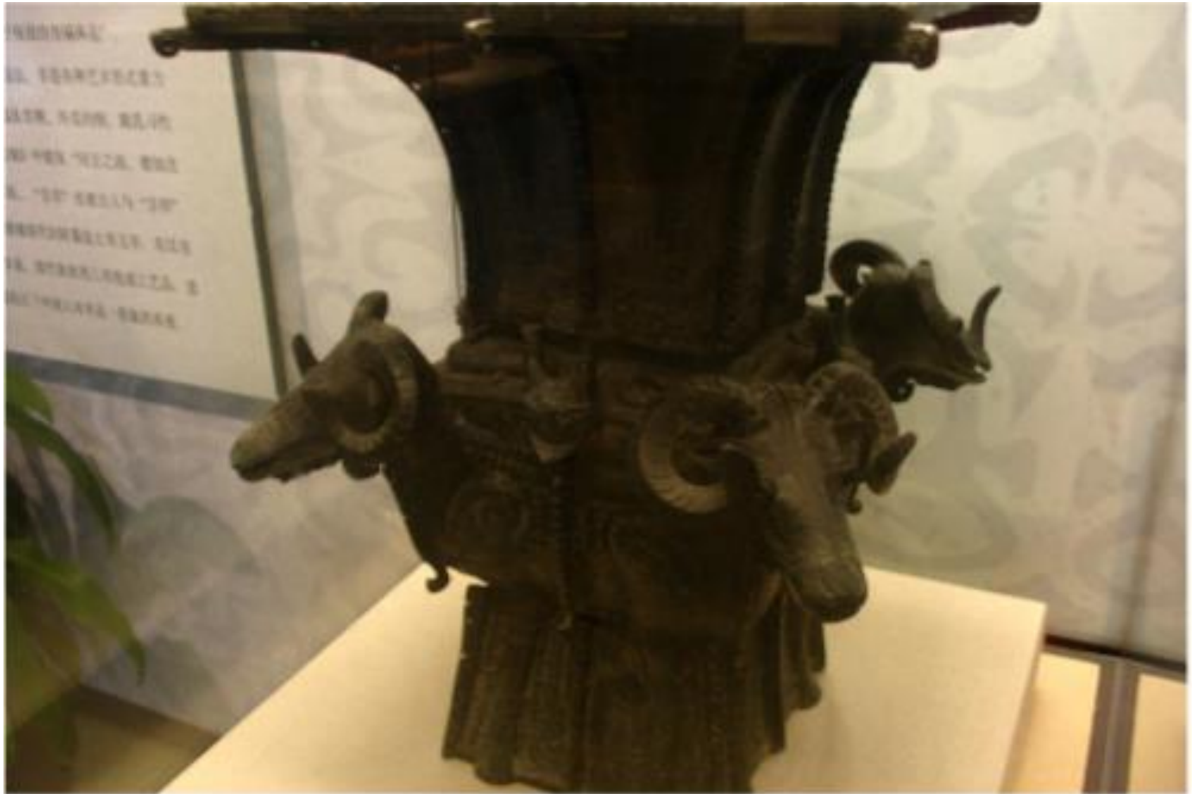
Zun Made from bronze